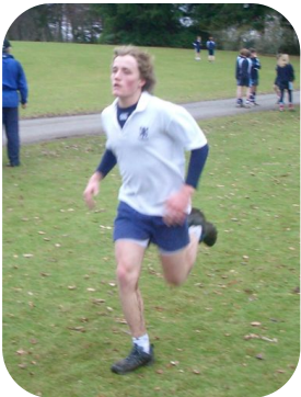
Mathesonian runners enjoying the Steeplechase