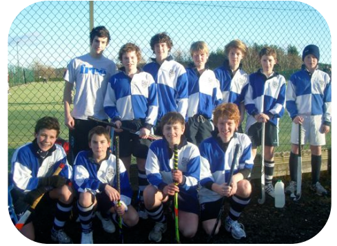
The Matheson's juniors: cold and tired, but showing what can be done when you work as a team

themselves what can be achieved with determination and, importantly, teamwork, coming 3 rd on goal difference. Experienced players worked well with relative novices, including Savlador in goal, who had never picked up a hockey stick before, and who has since represented the College U15 and 1 st VII! This was a great performance, and one which typifies the Mathesonian spirit of participation and teamwork.